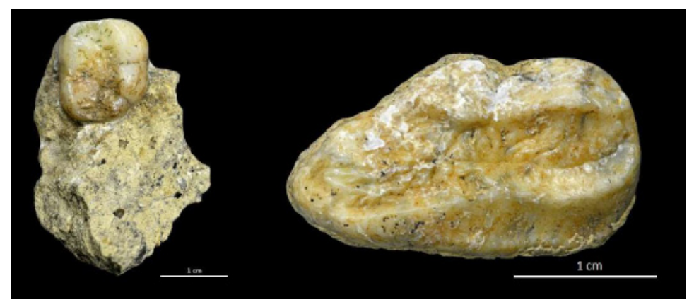
Figure 3: Orangutan lower molar partially exposed through breccia (left) and Asiatic black bear molar (right).

sediments may have been brought into the passage when the stream level was high and flowed along the cave fissure. It is believed that the river system in caves was abandoned as the base level fell, subsequently forming the current drainage flow. Faunal dental remains are preserved in the sediments and subjected to following cave depositional process of secondary calcite deposits on top of the sediments. On the other hand, in Gua Layang Mawas, coarser material in the form of breccia may have been deposited by a flow with higher energy to fill up the passage, followed by an episode of erosion leaving the fossil-bearing breccia preserved on part of the notches in the passage.