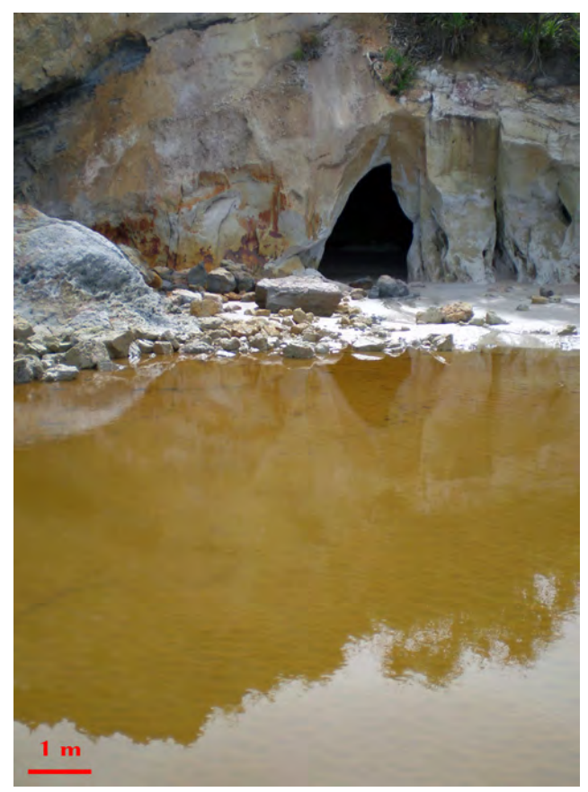
Figure 1: Pool of Fe-enriched saline water in the shores of the study area.

internal parts remain unstained. This indicates that during concretionary development, there was insufficient time for permineralization of the fragments.