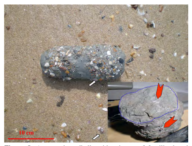
Figure 8: Armoured mudballs with mixture of fossilized and recent shell fragments. Small arrows point to recent shells on the sand as well as on the mudball. Inset, cross section of the mudball (mid-section) showing fossils within the mudball and recent shells on the exterior.

The softened material can now act as an accretionary layer, picking up contemporaneous shells or fragments of shells in the inter-tidal zones as it rolls around under the influence of waves. However, a time-lapse in events is evident.