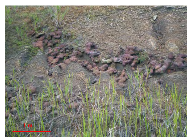
Figure 7: Occurrence of Fe-concretionary strata with limited extends in inland areas of the Lambir Formation. Note that these strata are usually not traceable across the highways onto the opposite slope cuts.