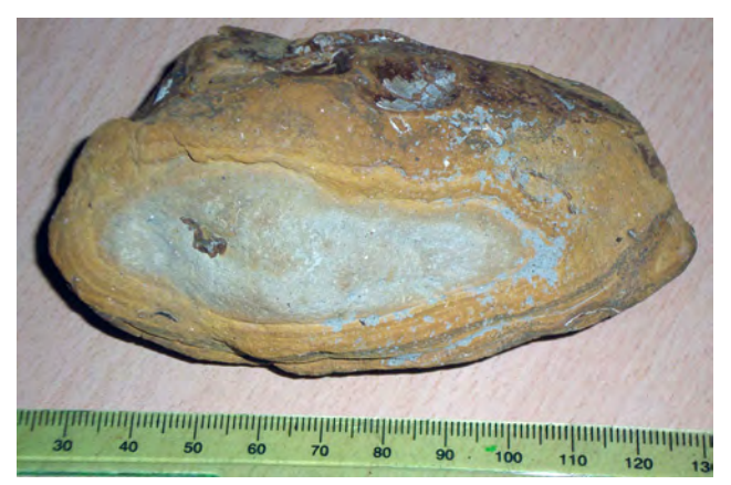
Figure 2: Concretionary layers (yellow colors being dominant) encompassing a Fe-depleted mudstone from another facies. Note the sharp boundary between both materials.

It is not uncommon to find concretionary strata that are either yellow or red in color indicative of varying composition (Figure 4). In low P-T conditions, red colors in Fe-oxides are usually indicative of the dominance of hematite, whereas, yellow colors are dominated by goethite. Under saline conditions, other combinations are possible involving CO32 ions. In general, the difference in color indicates fluctuation in moisture conditions in the sediments. In this respect, yellow colored platy concretions have been detected on grey shales (Figure 5). This provides and additional evidence that the facies under which the yellow colored platy concretions developed (oxidizing environment) is different from the facies involved in the development of the grey shales (reducing environment). In the location where this was detected, the platy concretions do not form a continuous layer but the fragments are