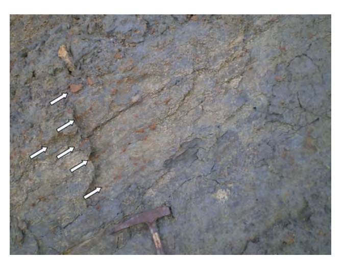
Figure 5: Platy concretions lying parallel to bedding planes. Surrounding material is grey shale. Arrows point to the concretions lying in the plane of deposition.

where the resident pH conditions (pH 1.5-2.5) favor the transformation of Fe<sup>3+</sup> into Fe<sup>2+</sup>. Chelation between organic matter originating from the swamps or peat and ferrous Fe may occur. Subsequent coatings of the chelated Fe-organic matter waters on the concretions of various sizes under oxidizing environment, enhance the transformation of ferrous iron to ferric iron with concomitant cementation.