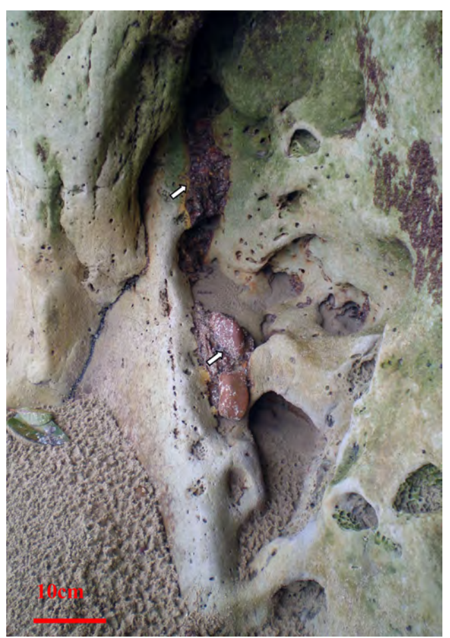
Figure 6: Development of concretionary stratas in a fine-grained sandstone. This provides a clear evidence that of a time-lapse and change in facies until the concretions have cemented in place. Arrows point to the remnants of the concretionary stratas.

An interesting feature was noticed in some caves where erosion of sand layers below the recently-formed concretionary layers occurred. Subsequent to this erosion, deposition of cobbles depleted in Fe occurred below the