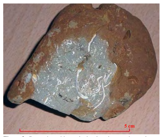
Figure 3: Concretion with poorly developed concretionary layers enclosing fossiliferous mud ball nuclei from another facies.

parallel to the bedding. This suggests that the deposition of the platy concretions were syngenetic (Pettijohn, 2004). The formation of the platy concretions however, evidently occurred before being transported to the depositional site under very special conditions that are different from the main processes involved in the formation of the grey shales. The platy concretions are made up of mud suggesting that they are part of an older weathered laterized layer. Under such circumstances, it is difficult to envisage the onset of diagenetic processes after deposition in a relatively impermeable material within the concretions as well as in the surrounding rock. Field examination confirms this view at the scale of observation.