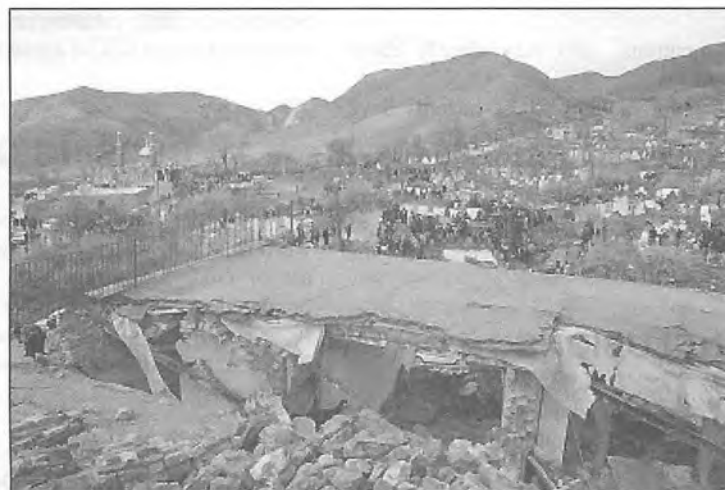
Figure: 3 Earthquake in Iran on 22/2/2005