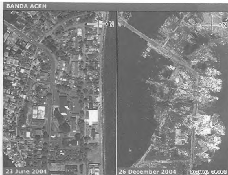
Figure: 2 Devastations in Banda Aceh