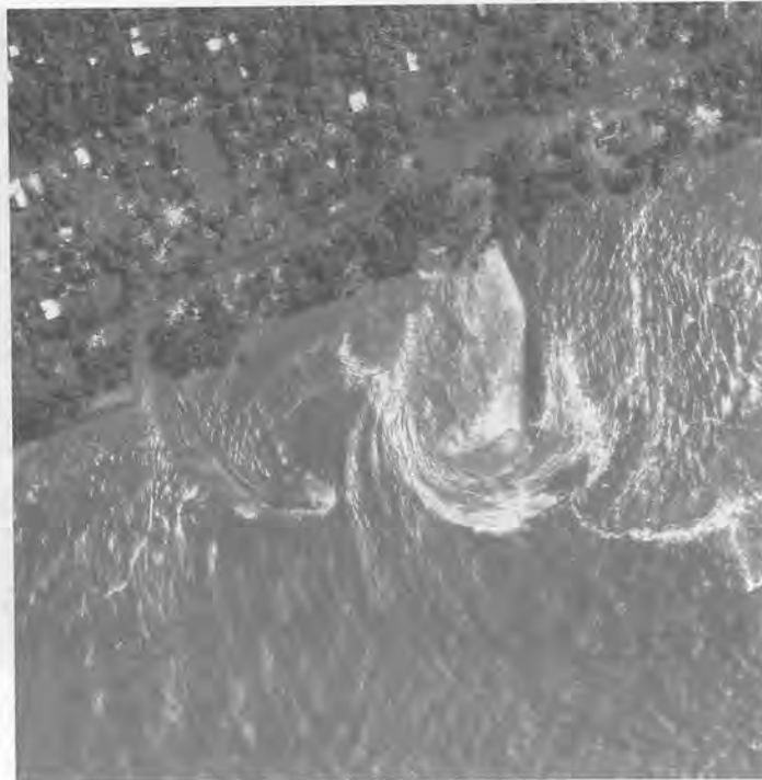
Figure: 4 Off the Coast of Sri Lanka

2. Verse 19.90 seems to indicate the thinning of the ozone layer, but clearly mentions earthquakes and landslides,