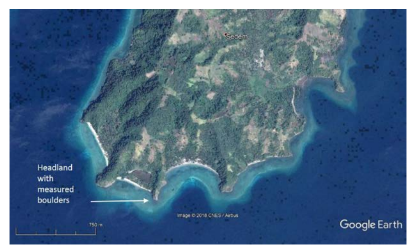
Figure 5: Google Earth image of the coast near Sedem (see Figure 3). The arrow is indicating the headland with boulders that have been measured for this study. The image was taken on 28<sup>th</sup> January 2016 and is the view from an eye altitude of 3.39 km; the location of the centre of the image is 6°46'36.51"N, 123°58'49.28"E.