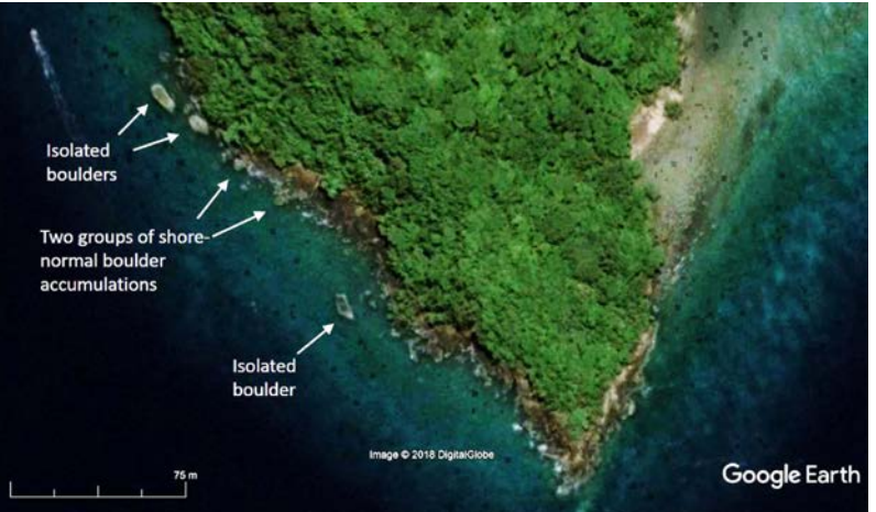
Figure 4: Google Earth image of the coast near Namat (see Figure 3) showing boulders deposited along the western shore of the headland. Three large isolated boulders and two groups of smaller, accumulated, boulders are indicated with the arrows. The image was taken on 14<sup>th</sup> November 2016 and is the view from an eye altitude of 330 m; the location of the centre of the image is 6°22'37.33"N, 124°03'23.55"E.