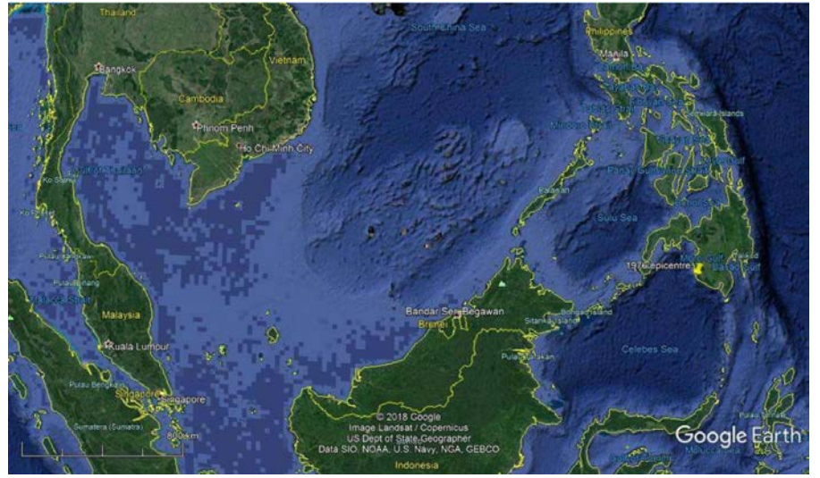
Figure 1: The region of southeast Asia indicating the location of the 1976 earthquake epicentre in the northeast of the Celebes Sea adjacent to Mindanao (Philippines) (see Figure 2).

Where boulder-sized clasts were considered to be present, the presumed boulders were measured using the measuring tool provided by Google Earth; however, only two axes of each boulder could be measured, that is the axes of the boulder up-face presented in the image. From experience, it is assumed that these represent the a and b axes of the boulder, the longest and intermediate axes respectively, with the shorter c axis being perpendicular to the image and, so, unmeasurable. These boulder measurements, along with a general figure for the density of the lithology, an estimate