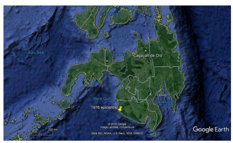
Figure 2: The island of Mindanao (Philippines) and the Moro Gulf. The epicentre of the 1976 earthquake and site of tsunami generation is indicated. See Figure 3.

The geology of both these locations appear to comprise mainly Tertiary greywacke sandstones with some interbedded shales and other lithologies (CCOP, 2018; MGB, 2018). Therefore, the rocks are likely to be well-