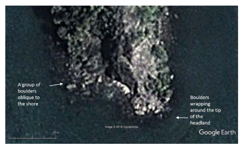
Figure 6: Google Earth image of the headland near Sedem (see Figure 5) showing boulders (arrowed) deposited at the tip of the headland and along the western shore of the headland. The image was taken on 14<sup>th</sup> February 2013 and is the view from an eye altitude of 90 m.