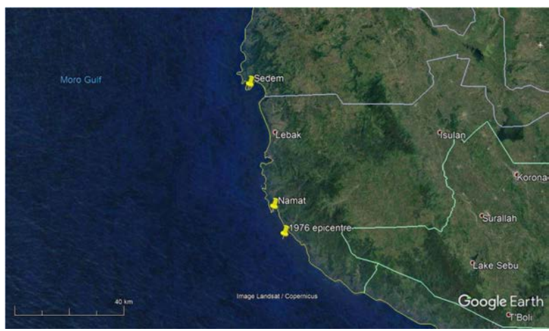
Figure 3: Part of the eastern shore of the Moro Gulf on the island of Mindanao (Philippines), indicating the location of the epicentre of the 1976 earthquake and tsunami generation site, and the two locations where boulders occurrences have been suggested near Namat and Sedem.