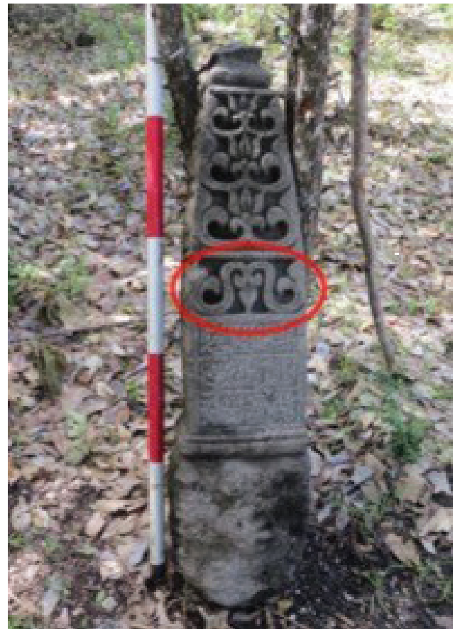
Figure 4: Plak-pling tombstone found in Lamreh (source: documentation from the scouting group of UNSYIAH-USM 2014)