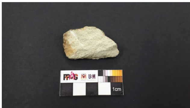
Figure 5: Tuff stone is used as a typical tombstone of Barus.

Between both the tombstones, the most interesting feature is the similarity in the shape of chiselling. Upon closer observation, the shape of the chisel can be seen on the head and main ornament of the Barus tombstone while it can be observed on the body and the final section on the Plak-Pling tombstone. On the Plak-Pling tombstone, there seems to be levels within the arrangement of the chiselled motif. This is likely to be representative of the social status of the buried individual. Besides that, the chiselling on the tombstones from Plak-Pling seems more refined compared to the Barus tombstones. This would seem indicative of a more highly skilled workmanship by the artisans who made the Plak-Pling tombstones. The sultans of Aceh had